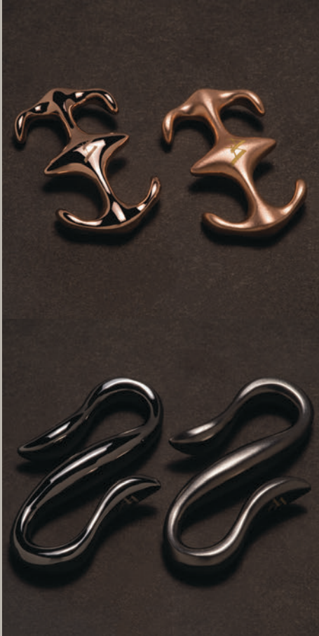
Black Ruthenium Mirror & Satin